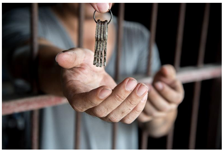
Help released prisoners