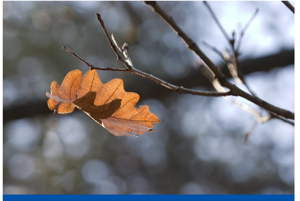
Policy is slow to change