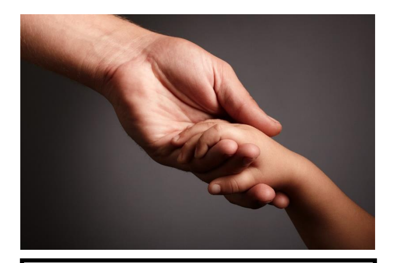
Help families of prisoners