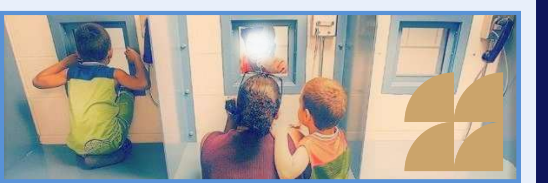
Understand families more who have a loved one who is incarcerated